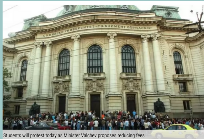
Students will protest today as Minister Valchev proposes reducing fees

https://news.err.ee/1609654163/vocational-school-no-longer-free-for-recent-vocational-higher-education-grads